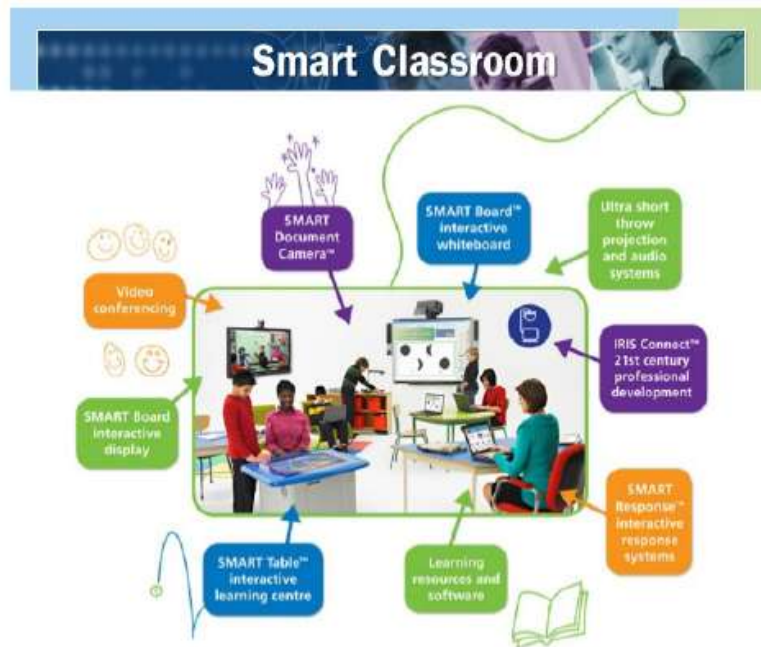
Figure 3: Smart classroom [8]

In traditional classroom teacher is use to control or manage her classroom alone. The smart classroom is a classroom which is embedded with smart devices which have made teacher's job easy [5].The use of IOT devices for teaching and learning purpose is a new trend among institutes which provides a innovative approach to education and classroom management. Some of them are successfully utilized few of them are listed below: